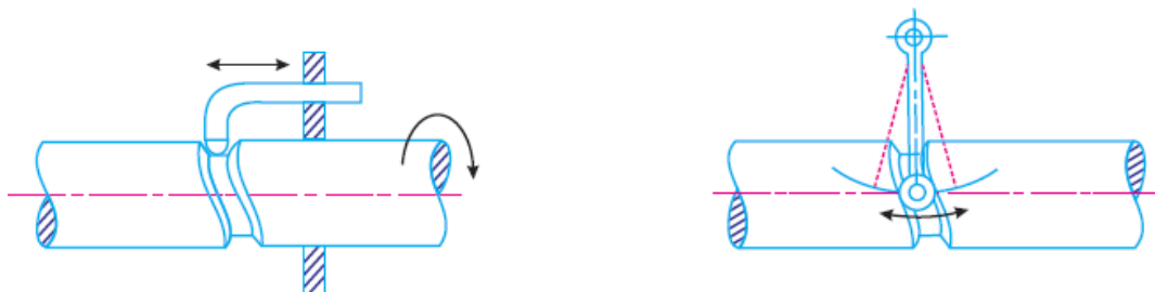
(a) Cylindrical cam with reciprocating follower.