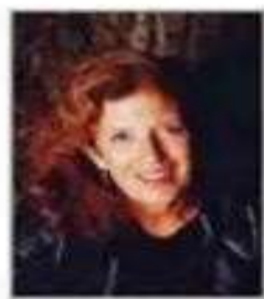
Dame Anita Roddick (1942-2007)

"A business that makes nothing but money is a poor kind of business"